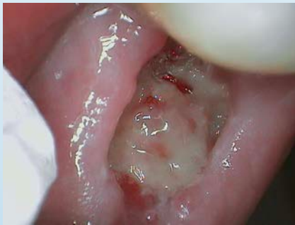
BloodSTOP® iX placed post-implant - at 14 days, healed