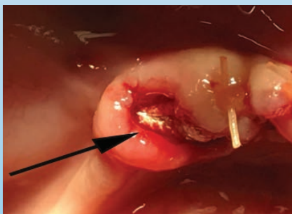
BloodSTOP® iX stops bleeding inside socket after extraction